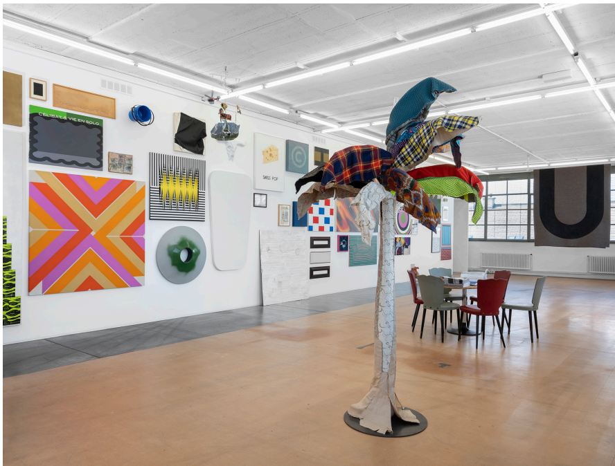
Exhibition views