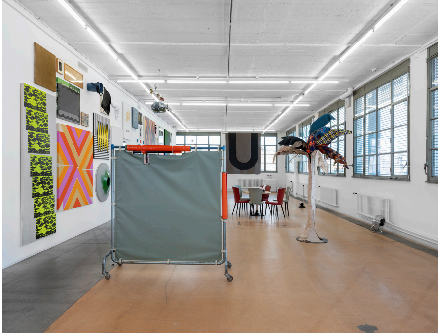
Exhibition views