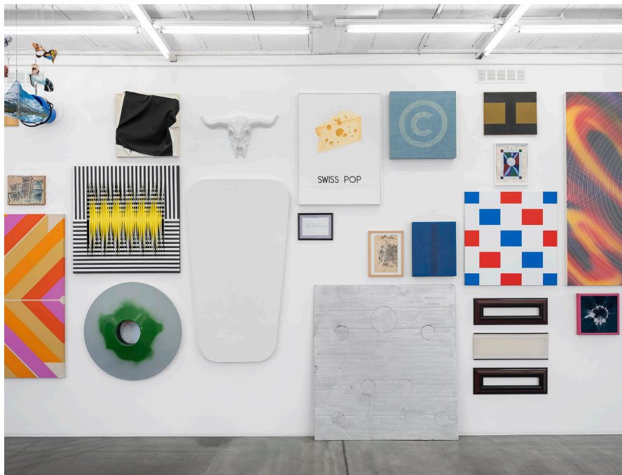
Exhibition views