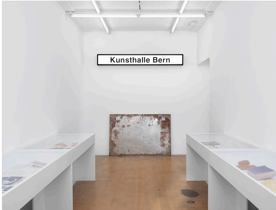
Exhibition views