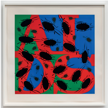
General Idea (1969-1994) Untitled (AIDS with Cockroaches #2) , 1993 Gouache on offset on paper 81 x 81 cm ; 88 x 88 x 5 cm encadré court. MAI 36 Gallery, Zurich