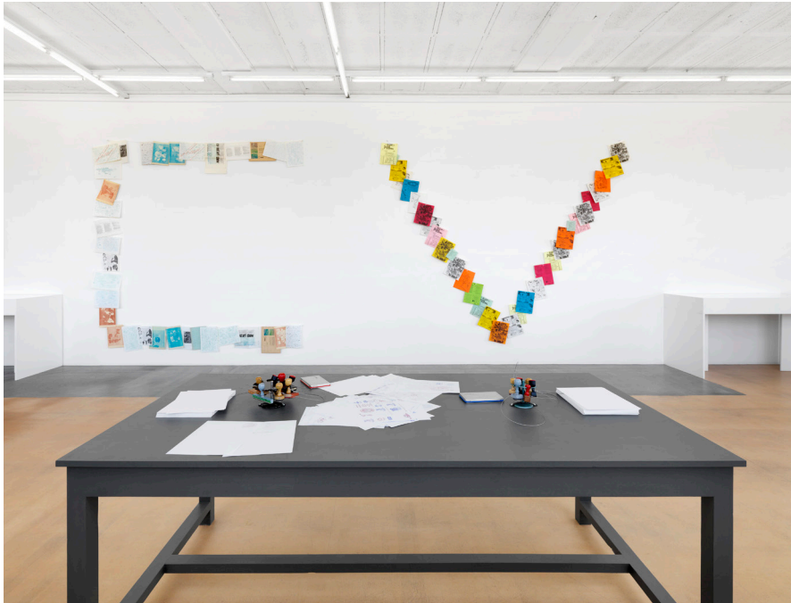
Exhibition view