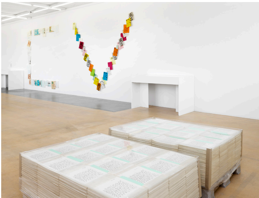
Exhibition view