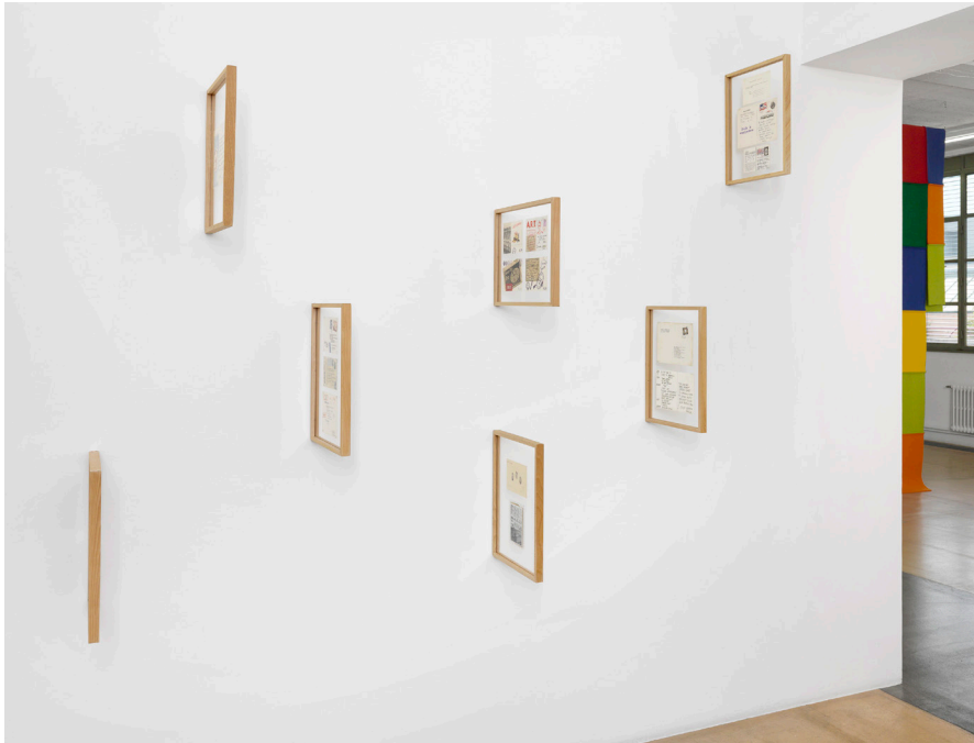
Exhibition view