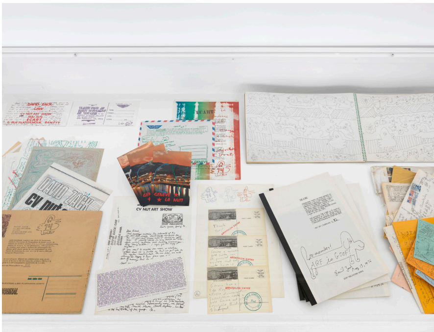
Exhibition view