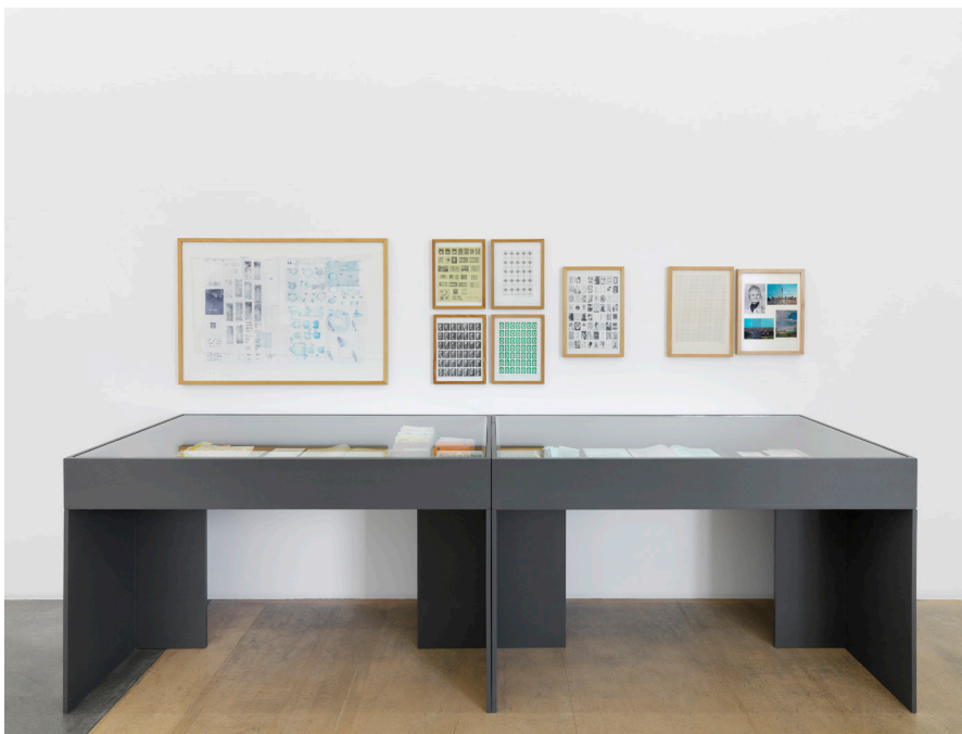
Exhibition view