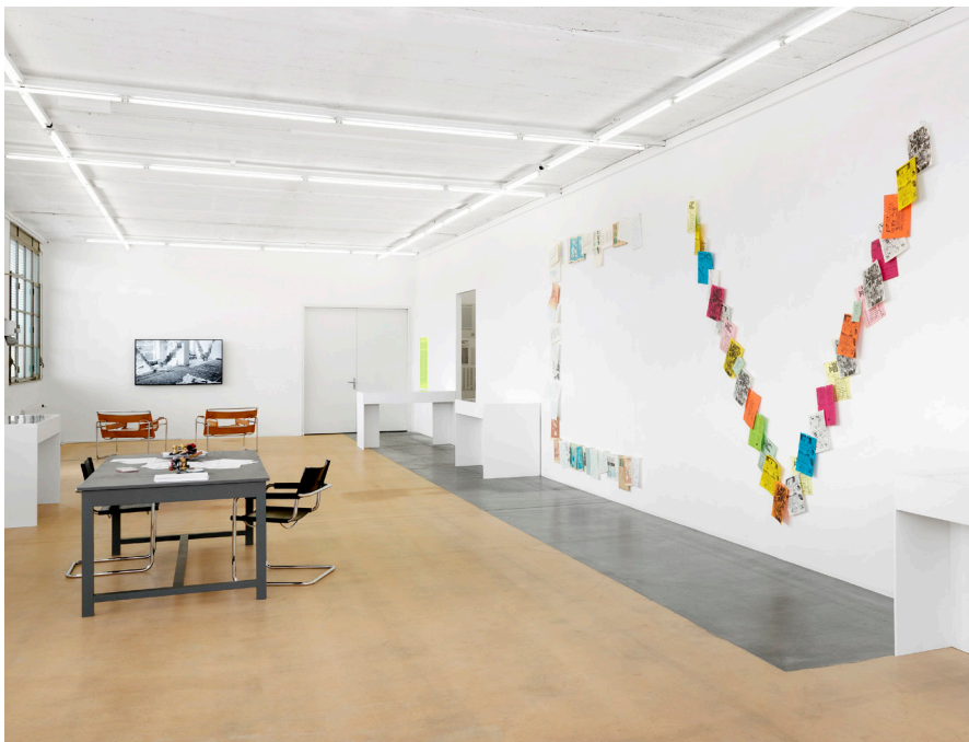
Exhibition view