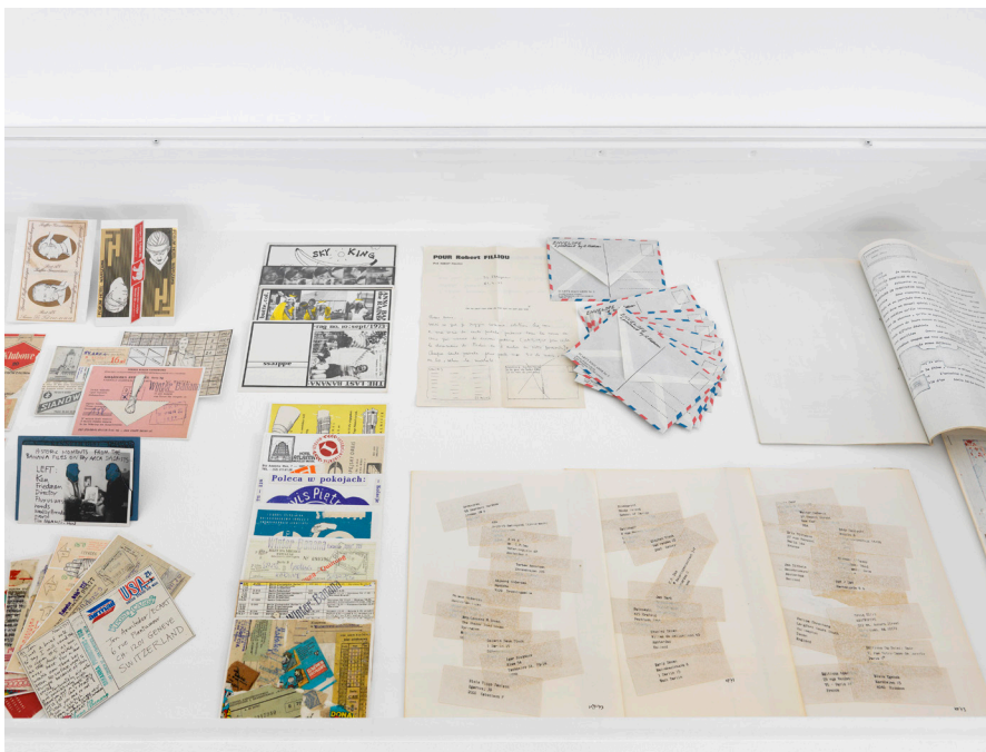
Exhibition view