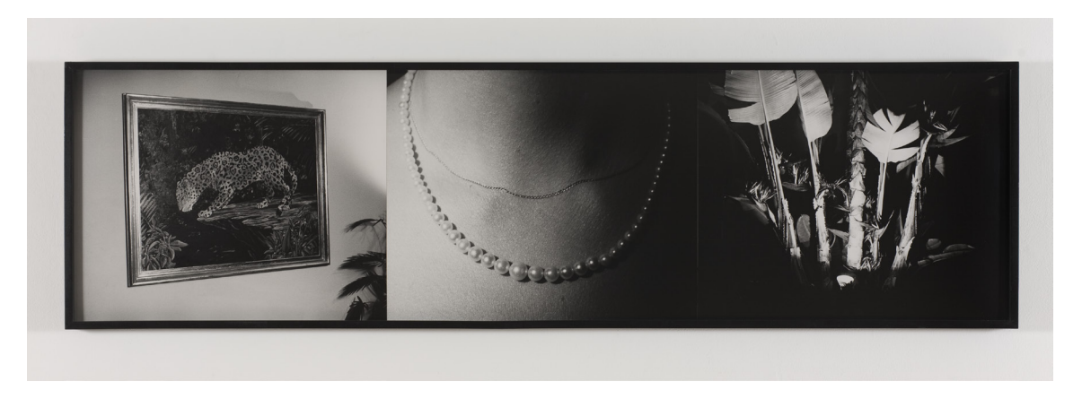
William Leavitt, The Tropics , 1974. Three black and white photographs, text, 40.64 × 152 cm.