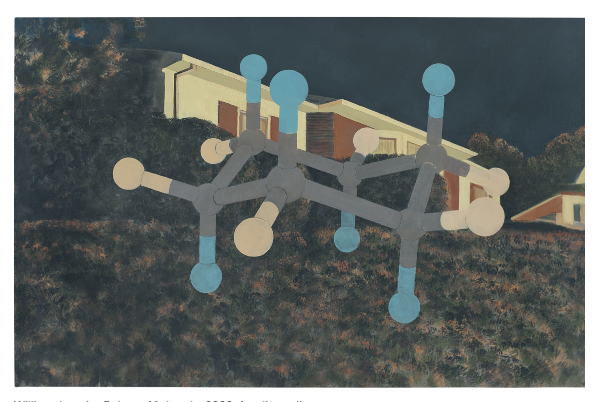
William Leavitt, Solvent Molecule , 2009. Acrylic on linen canvas, 114 × 177.80 cm. Coll. Bettina Korek, Los Angles (CA)