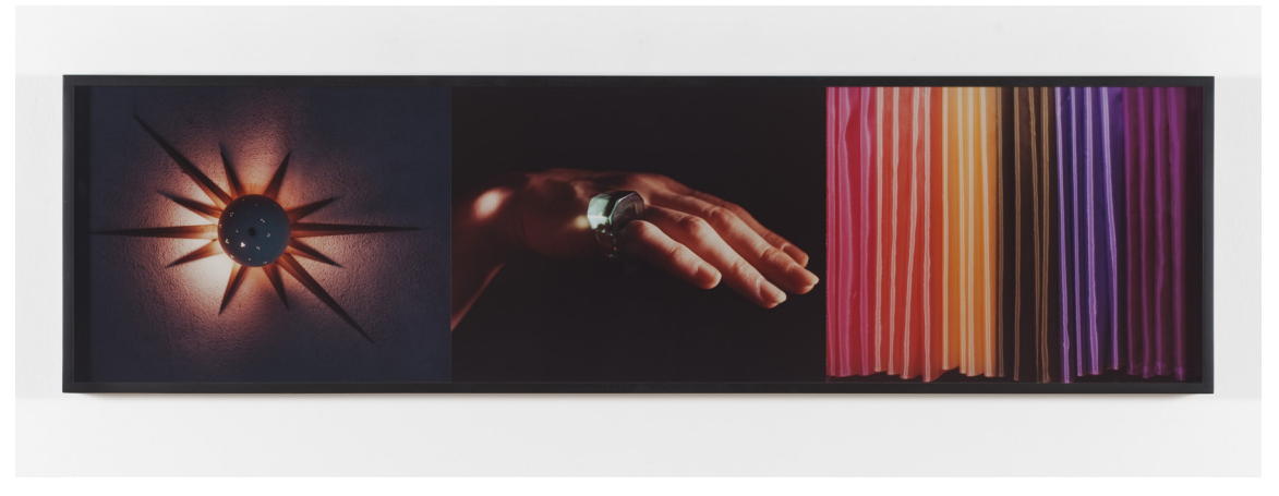
William Leavitt, Spectral Analysis , 1977. Chromogenic photograph 42.9 × 154.6 cm. Collection William Leavitt, Los Angeles (CA)