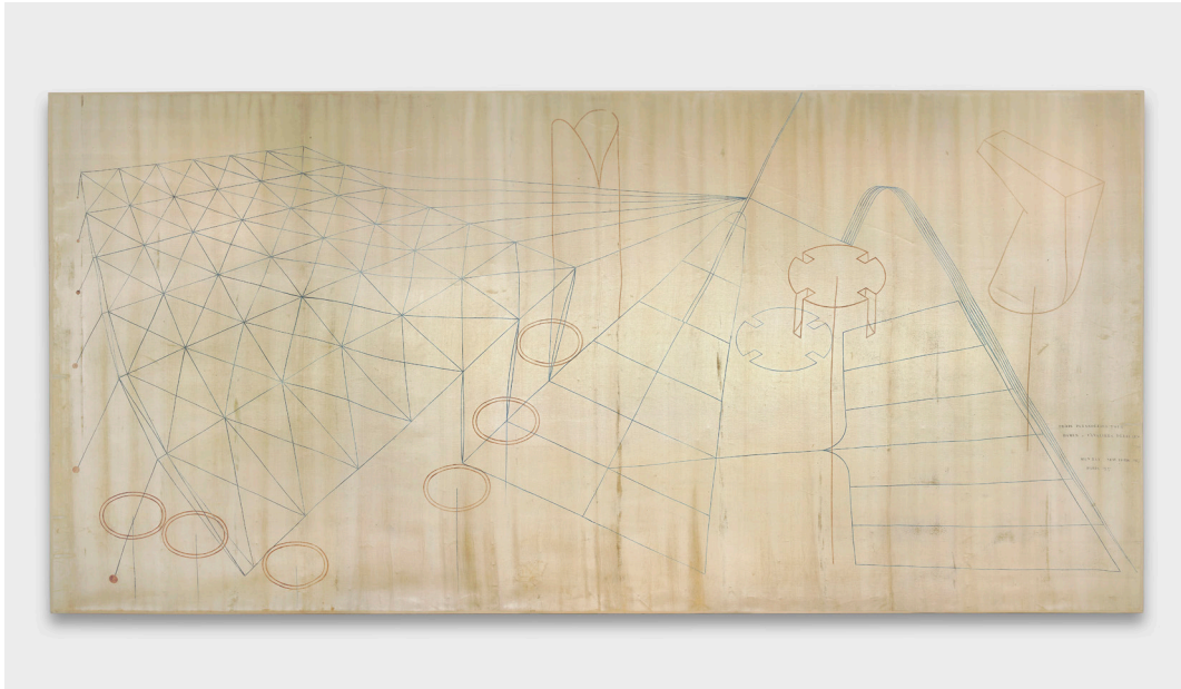
Man Ray (1890-1976), «Trois parasoleils pour dames et cavaliers délicats», 1917 - 1927, drawing in blue ink and brown on fine silk fabric glued to canvas, 233 × 488.5 cm, coll. MAMCO, gift from a Geneva collector