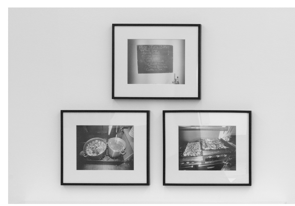
Gordon Matta-Clark, FOOD, exhibition view, MAMCO, 2017