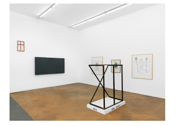
Martin Kippenberger, The Museum of Modern Art Syros , exhibition view, MAMCO, 2019