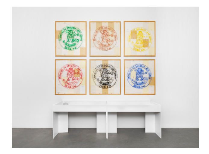
Martin Kippenberger, The Museum of Modern Art Syros , exhibition view, MAMCO, 2019