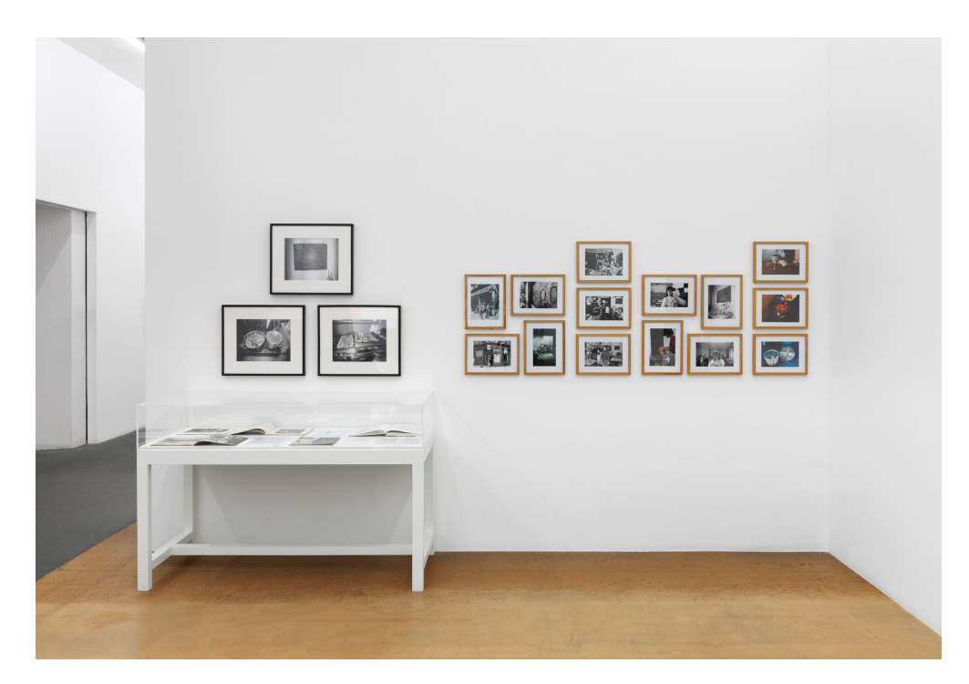
Gordon Matta-Clark, FOOD, exhibition view, MAMCO, 2017