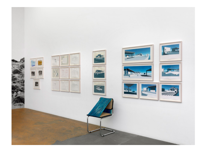
Martin Kippenberger, The Museum of Modern Art Syros , exhibition view, MAMCO, 2019