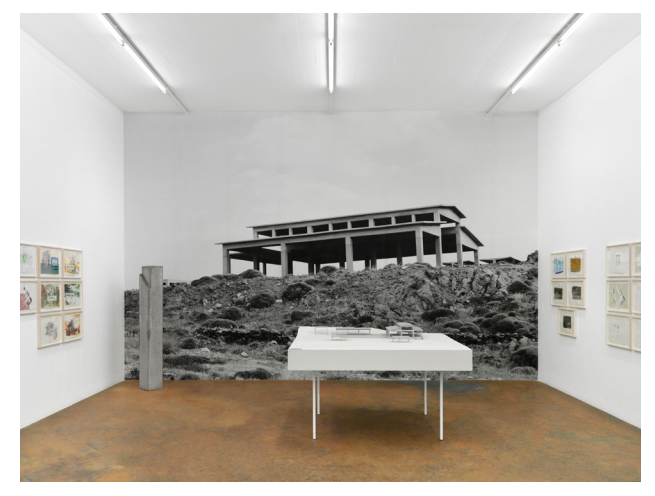
Martin Kippenberger, The Museum of Modern Art Syros , exhibition view, MAMCO, 2019